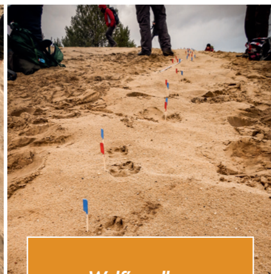
Wolf's gallop. After the training, the participants are able to distinguish between a wolf in walk or gallop.