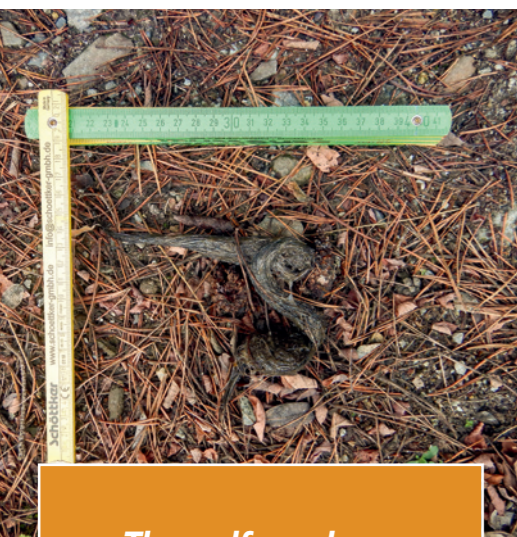
The wolf was here. It is also part of the training to be able to analyse and document wolf scat.

The following overview is preliminary, as the seminar program is open for further topics, which arise by the exchange of the participants or current events during the project.